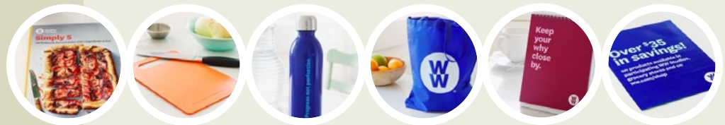
"Simply 5" cookbook

Northrop Grumman employees who purchase a WW membership plan between Sept. 9 and Oct. 18 can redeem a FREE Starter Kit. Here's what each Starter Kit includes: