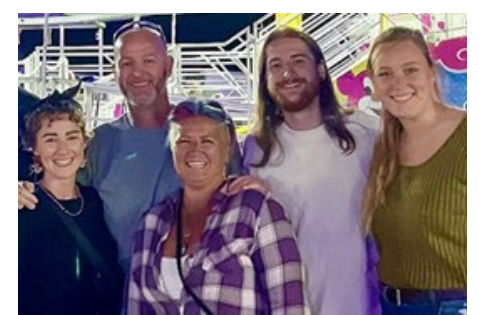
Benefits to Help You Through Life's Unexpected Challenges

A family's fight against stomach cancer and the resources helping along the way.