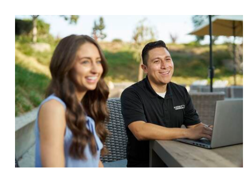
New for 2025: Free, Tailored Financial Education

A Q&A about Northrop Grumman's newest financial offering, available to all employees.