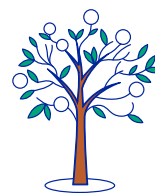
Death of a Loved One