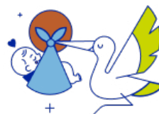
Growing Your Family