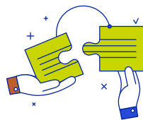
Separating From Your Partner