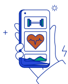
Facing Health Challenges