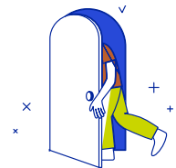
Leaving the Company