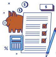
Buying Something Big