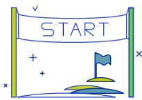
Joining Northrop Grumman