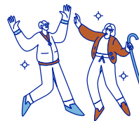
Planning to Retire