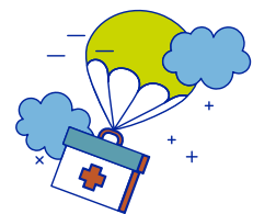
Natural Disaster Support