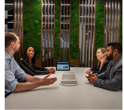
Thriving in a Multigenerational Workforce