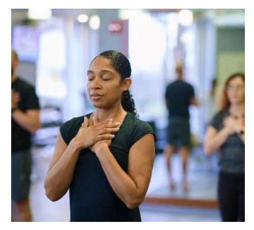
Preventive Care: Your Pathway to a Healthier Tomorrow